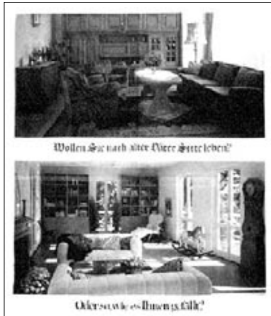
Figure 5: Furniture advertisement. The inscription states: "Would you like to live according to old customs? Or in the way you would like to?"