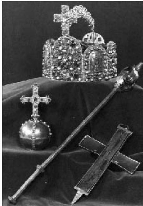
Figure 2: Insignia of the Holy Roman Empire, Vienna

Remains which signify tradition symbolize a certain time or era. In their concrete presence, they stand for the era in the past which they represent. The coronation insignia on view in the Hofburg of Vienna (from the second half of the tenth century), for example, point to the Middle Ages. (Figure 2) In our historical memory of symbols, a crown represents a different time, mainly the Middle Ages, and a different system of power, that of kings and emperors and not of presidents and prime ministers.