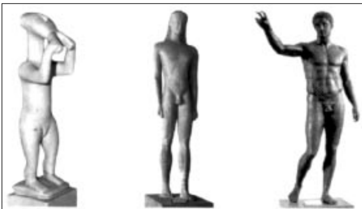
Figure 8: Figure from the Cyclades (end of third millennium BC), Young Man (ca. 550 BC), Young Man (ca. 340 BC). Wolfgang Hug et. al. (eds.), Unsere Geschichte. Bd. 1: Von der Steinzeit bis zum Kaiserreich des Mittelalters , Frankfurt am Main: Diesterweg, 1987, p. 53.

Another example, which makes the change of time even more apparent, is taken from a school-book. In a series of images of Greek sculptures, a genuinely historical development is visualized. (Figure 8) The aesthetically guided narration is charged with a historical sense construction that can easily be identified as the process of anthropomorphisation in Greek sculpture from the abstract to the concrete. This visual presentation of a historical development transports the traditional educational package of the ancient world, namely its humanization of people.