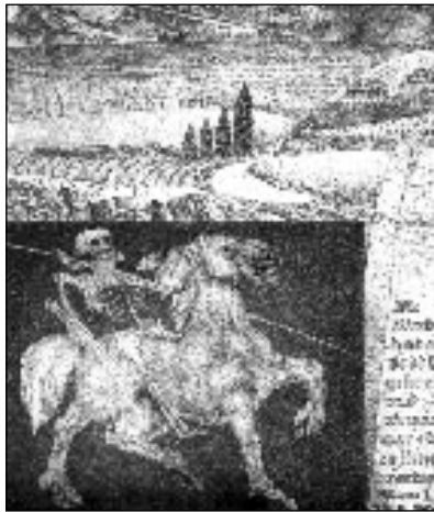
Figure 9: Werner Hennig, “Looking Back” (1975) Sammlungs- und Dokumentationszentrum Kunst der DDR, Beeskow

Although history as a narrative bridge between times becomes visible in these examples, its power of generating historical sense is rather weak. There are pictorial representations, however, which explicitly thematize the meaningful historical relation between historical periods and therefore possess a strong historical sense. I am referring to three examples from an East German collection of etchings entitled “On the 450th anniversary of the German Peasants’ War” (1975): Werner Henning’s “Looking Back” ( Rückblick ), Heinz Plank’s “Knowledge and Experience – the Wealth of Man” ( Wissen und Erfahrung – der Reichtum des Menschen ), and Alexandra Müller-Jontschewa’s “Renaissance Landscape in Central Germany” ( Mitteldeutsche Renaissancelandschaft ) give a clear but mostly ideological message of historical sense. (Figures 9, 10 and 11)