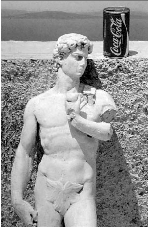
Figure 6: Postcard of 'Greece'. Edition Dimitri Haytalis, 1986

Just as the experience of temporal difference as a necessary presupposition for historical perception can be aesthetically formulated, it can also form the starting point for the bridging of historical eras on a visual level.