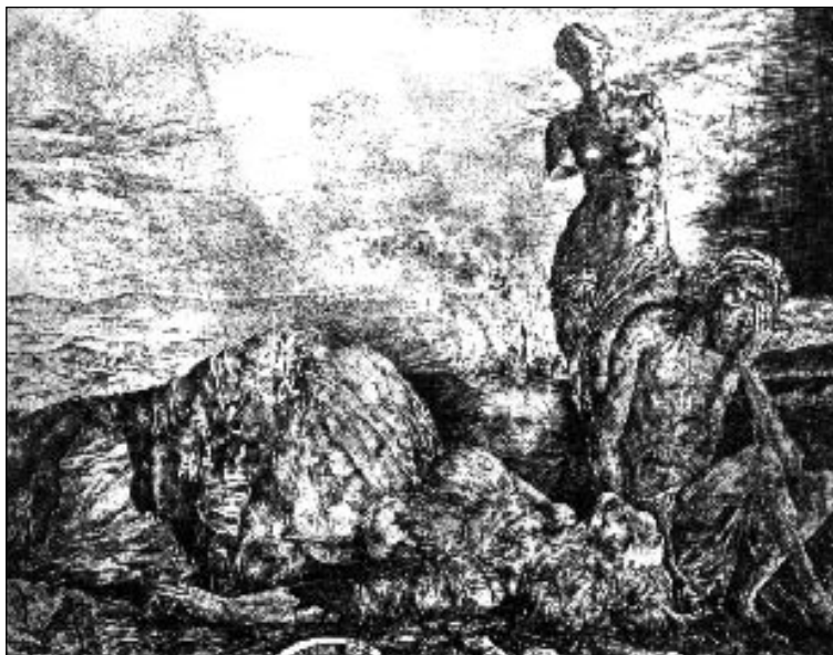
Figure 11: Alexandra Müller-Jontschewa, "Renaissance Landscape in Central Germany" (1975) Sammlungs- und Dokumentationszentrum Kunst der DDR, Beeskow

Vividly, Henning's piece presents as progress the historical sense that connects past and present. Plank's piece is somewhat more differentiated: it presents progress as a man-made development. Yet, the image of history as a learning process, as suggested by the title, is not visible and must be added meta-aesthetically and thus with a didactically raised forefinger. Finally, Müller-Jontschewa's piece, a composition in which the figures represent different eras, accentuates a remarkable kind of historical sense generation, that of mourning.