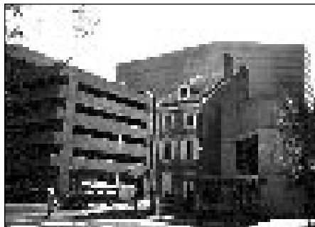
Figure 3: Declaration (also Graff) House, Philadelphia Photograph: Jörn Rösen, 1988

Is there an aesthetic way of creating a narrative of historical meaning that transforms the past into history? The experience of temporal difference is a necessary condition of historical interpretation which can be easily realized aesthetically. This difference is not a simple chronological one between the 'earlier' and the 'later', between the past and present, but a qualitative temporal alterity. It is a very simple fact that the 'then' is different from the 'now' in its mode of temporality. Therein lies the crucial point. This difference can be perceived through a genuinely visual experience. Take, for example, the famous building in Philadelphia in which Thomas Jefferson wrote the Declaration of Independence and which is visually very different from the adjacent modern car park. (Figure 3) The two buildings stand for two different eras