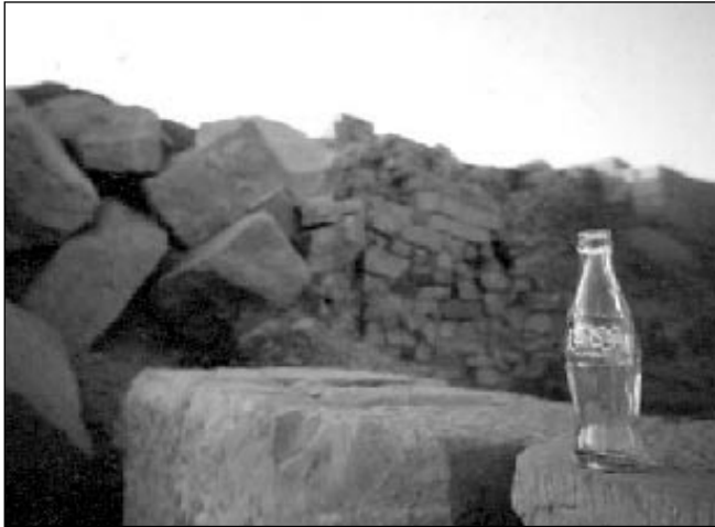
Figure 4: Coca-Cola bottle among the ruins of Ancient Egypt

aesthetic level. Examples which prompt the making of historical sense can be found everywhere. These can take the form of accidental constellations, such as when a tourist observes a Coca-Cola bottle on top of an ancient relic, for example. (Figure 4) These constellations can also be strategic, as in commercials (Figure 5), or as consciously aesthetic performances. (Figure 6)