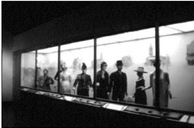
Figure 7: Natal Museum, Pietermaritzburg, South Africa Photograph: Jörn Rüsen, 1990

Another example, which makes the change of time even more apparent, is taken from a school-book. In a series of images of Greek sculptures, a genuinely historical development is visualized. (Figure 8) The aesthetically guided narration is charged with a historical sense construction that can easily be identified as the process of anthropomorphisation in Greek sculpture from the abstract to the concrete. This visual presentation of a historical development transports the traditional educational package of the ancient world, namely its humanization of people.