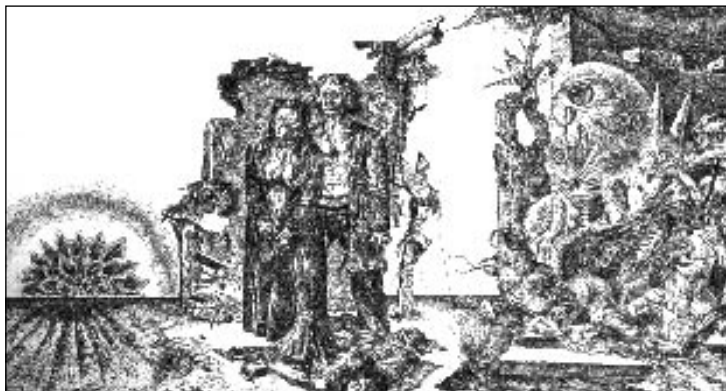
Figure 10: Heinz Plank, “Knowledge and Experience – the Wealth of Humankind” (1974) Sammlungs- und Dokumentationszentrum Kunst der DDR, Beeskow