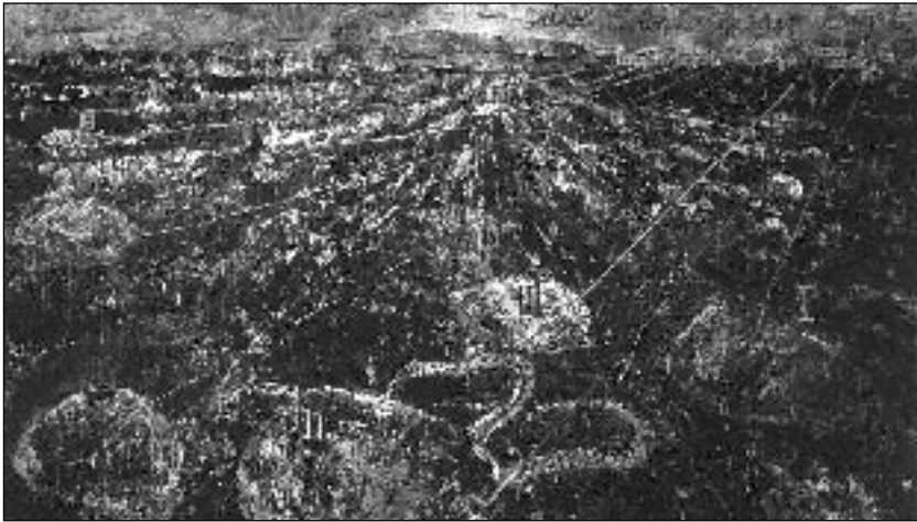
Figure 12: Anselm Kiefer, "The Order of the Angels" (1983/84) Art Institute of Chicago

absence of sense in a sense-bearing way. This is true for Kafka's novels as well as for many paintings, such as the works of Anselm Kiefer, to mention an example. (Figure 12)